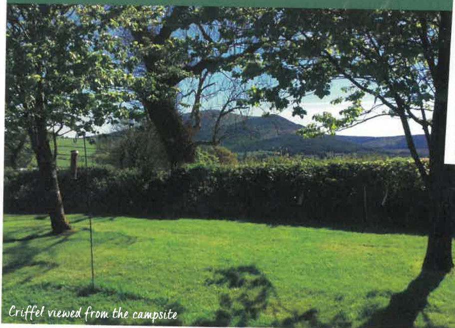
Criffel viewed from the campsite