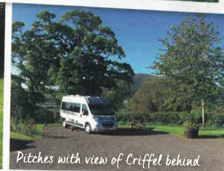
Pitches with view of Criffel behind

Criffel View is an absolute gem of a site, so beautifully landscaped and well-positioned that it makes a delightful overnight stopover or a base for a short break.